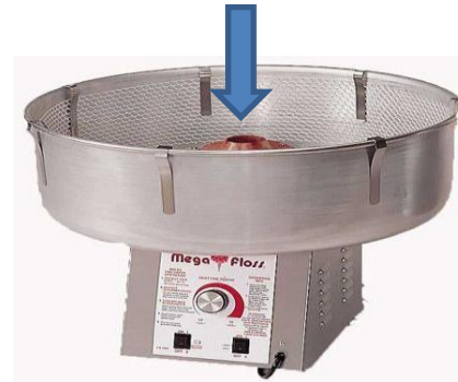
MODELS MAY VARY